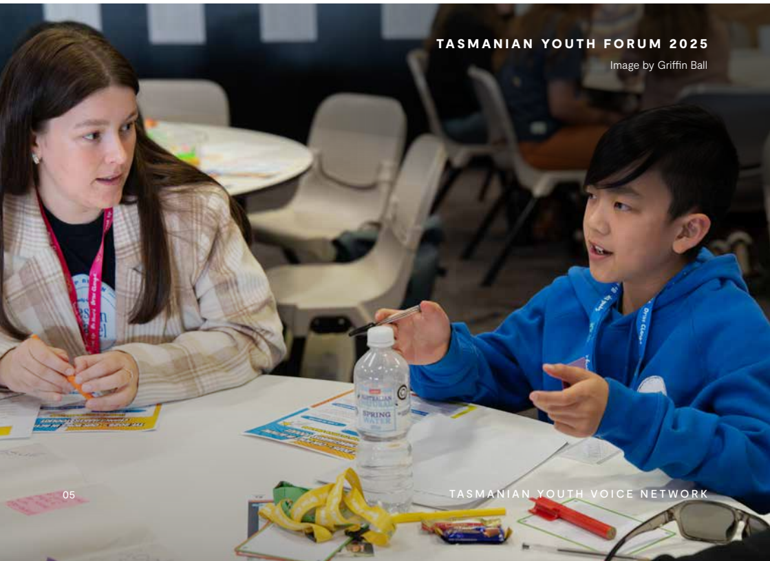
TASMANIAN YOUTH FORUM 2025

YNOT is committed to upholding the safety, wellbeing, and rights of children and young people. All YNOT staff hold a Registration to Work with Vulnerable People (RWVP) and follow strict child safe policies and practices.